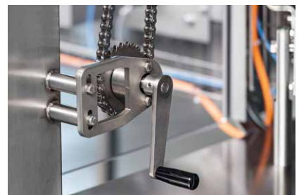
Height adjustment feature as standard