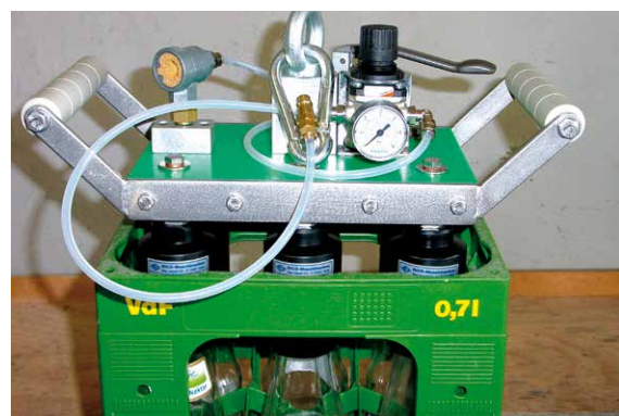
Manual packing head with 6 gripper heads for 0,7 l VdF bottles