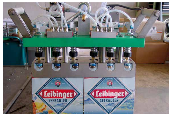
Special manual packing head for repacking 2 six-pack packages in pinole box